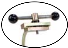
Aerial Strand Clamp 4035-A

Lightweight and hand-operated. When proper crimping pressure is reached, a bypass valve opens.