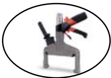
Hand Crimper 4036-25

Designed to hold a 4041-P splicing head in aerial splicing applications. Anchored to the suspension strand, the strand clamps behind and below the splice bundle and can be used with strands from 5 mm (3/16") diameter to 10 mm (3/8").