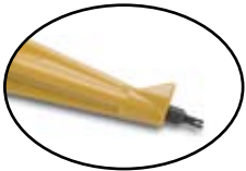
Wire Insertion and Cut-off Tool 4051

The 4049-VTB Variable Traverse Brace fits into the 4041-SH Splicing Head Holder and is designed to hold the MS 2 Splicing Head with Pedestal Support. It enables the user to position the MS 2 splice head where needed for greater splicing flexibility.