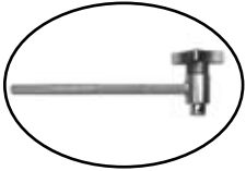
Variable Traverse Brace 4049-VTB

A module probe that permits one pair checking without damaging wire insulation. The prongs fit the test entry port of all MS 2 modules. The cord permits easy connection to a talk block or test set.