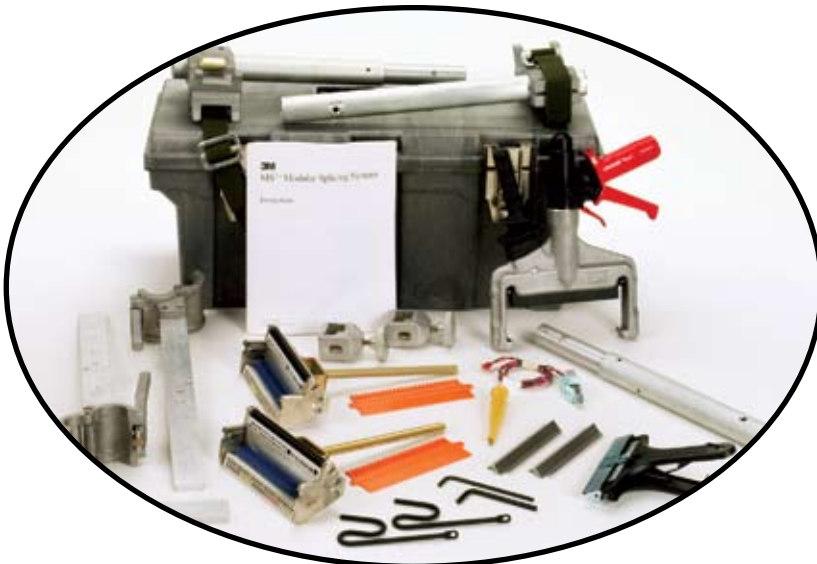
The 3M™ MS™ Splicing Rig 4021-M2/36/NXG is a complete splicing rig designed for one- or two-person fold-back or inline splicing.