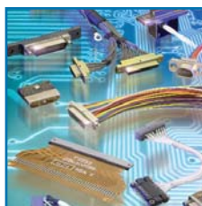
Microdot Connectors and Cables