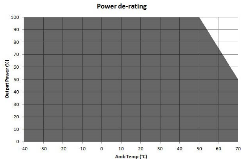
Figure 1. Derating Curve for all Outputs

De-rate linearly from 100% at 50°C to 50% at 70°C