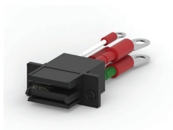
50A Cable Assembly