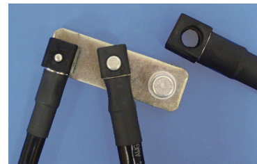
RAPID LOCK Bus Bar Connectors