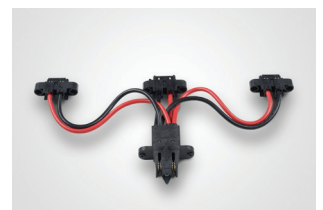
Bus Bar Clip and Cable Assembly