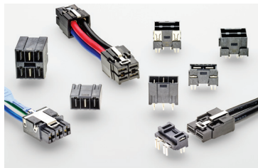
ELCON Mini Connectors