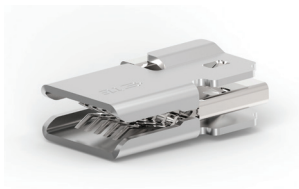
150A Bus Bar Connector