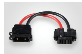
MULTI-BEAM XLE Panel Mount to Squeeze Release