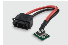
MULTI-BEAM XLE Panel Mount to Press-Fit