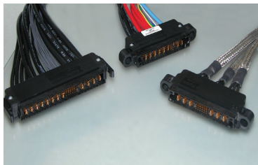
MULTI-BEAM XLE Cable Receptacles