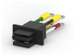
25A Cable Assembly