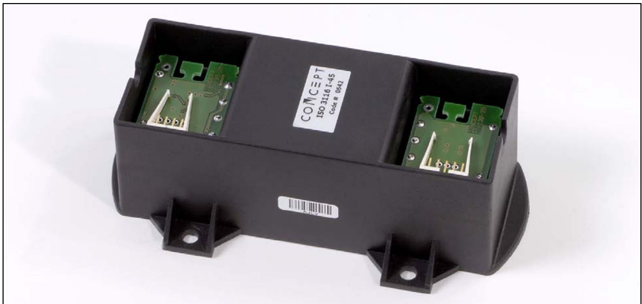
Fig. 1 Power Supply ISO3116I

For drivers adapted to various types of high-power and high-voltage IGBT modules, refer to www.IGBT-Driver.com/go/plug-and-play