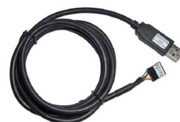
4D Programming Cable

Using a non-4D programming interface could damage your processor, and void your Warranty.