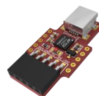
uUSB-PA5 Programming Adaptor