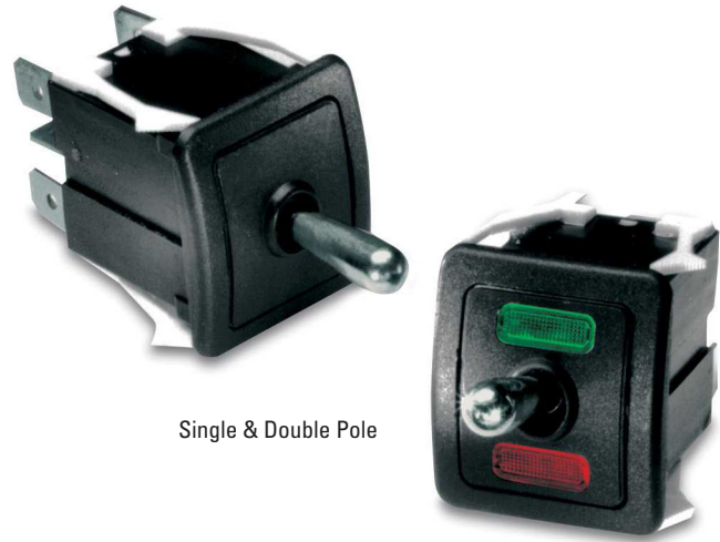
Single & Double Pole

A choice of models are offered to handle current from 16 amps to low level electronic switching levels.