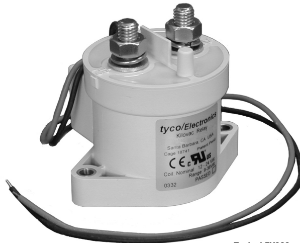
EV200 Series Contactor (CZONKA® Relay, Type III)

Typical EV200 applications include battery switching and back-up, DC voltage power control, circuit protection and safety.