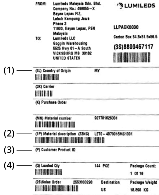
Figure 14. Example of outer box label for LUXEON CX Plus CoB.

Notes for Figure 14 – Outer Box Label descriptions for customer use: