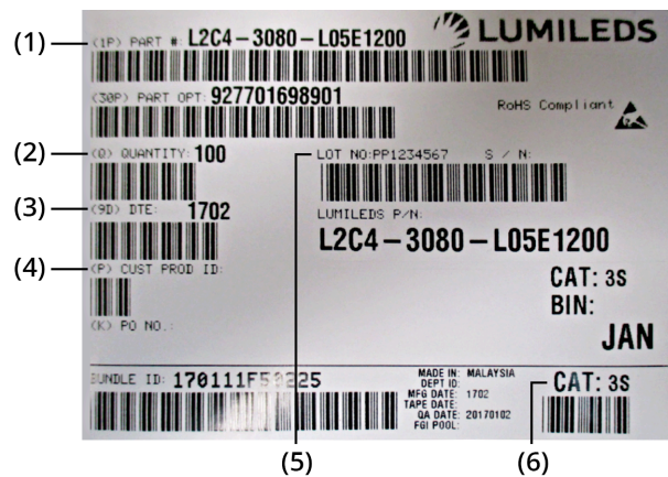
Figure 12. Example of inner box label for LUXEON CX Plus CoB.

Notes for Figure 12 – Inner Box Label descriptions for customer use: