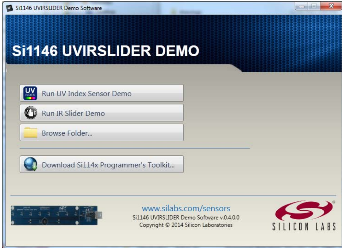
Figure 2. UVIRSLIDER Demo Main Window

Figure 2 shows an example of the UVIRSLIDER Demo main window when connected to the Si1146 UVIRSlider2EK Demo Board.