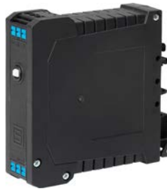
Housing RI with Circuit Breaker