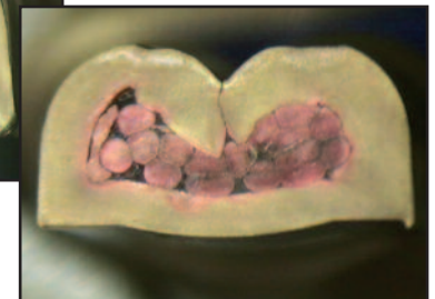
Gross Deformation of Crimped Terminal Resulting from Material Buildup in Crimper