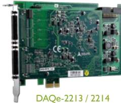
DAQe-2213 / 2214