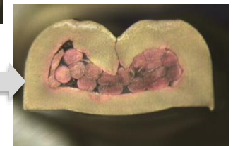
Visible deformation of outer crimp surface because of indentation from material buildup on crimper.

Chromium plating has the ability to be applied uniformly and consistently and exhibits excellent adhesion to the base metals. The unique benefits of chromium plating, such as ease of application, consistency of plating, adhesion to base metal, extremely low coefficient of friction, very high hardness, and resistance to adhesion, make it truly difficult to match in crimp performance and durability. However many alternative coatings are being attempted, and some show excellent promise in specific applications.