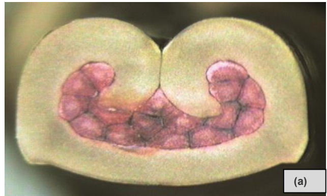
Cross Sections Showing Minimum (a) and Maximum (b) Area Index per Terminal Specification—a Variation of \pm 3.5\%

Therefore, varying the CW by 2% would result in a CH variation of 2%, or 0.0014 in. At a CH tolerance of \pm 0.002 in, 35% of the total CH tolerance would be used by a 2% variation in CW. Thus, the importance of crimp width control is obvious when tooling is changed during a production run.