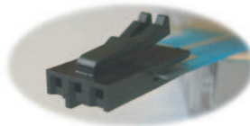
Crimflex Female Receptacles with a Latch Housing (RL)