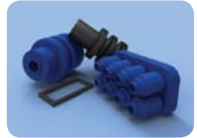
Single & Gang Wire Seals with Interfacial Seal

*Note: -0 for tin finish, -1 for gold. See Mini-Universal MATE-N-LOK section in catalog 82181 for details.