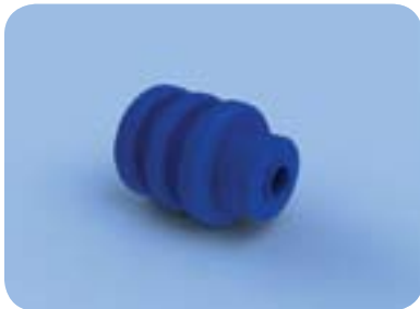
Single Wire Seal