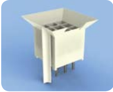
Vertical PC Board Pin Header