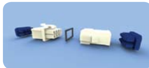
Wire Seal Configuration