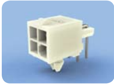
Right Angle Pin Header