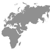
Europe Middle East Africa