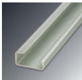
G rail 32 mm (NS 32)

DIN rail - NS 32 AL UNPERF 2000MM - 1201028