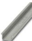
DIN rail, material: Steel, unperforated, 2.3 mm thick, height 15 mm, width 35 mm, length: 2 m

DIN rail - NS 35/15-2,3 UNPERF 2000MM - 1201798