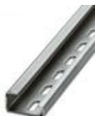
G-profile DIN rail, material: Steel, perforated, height 15 mm, width 32 mm, length 2 m

DIN rail - NS 35/15 CU UNPERF 2000MM - 1201895