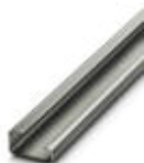
G-profile DIN rail, material: Steel, unperforated, height 15 mm, width 32 mm, length 2 m

DIN rail - NS 32 UNPERF 2000MM - 1201015