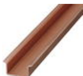
DIN rail, material: Copper, unperforated, 1.5 mm thick, height 15 mm, width 35 mm, length: 2 m

DIN rail - NS 35/15 CU UNPERF 2000MM - 1201895