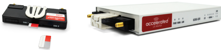
DUAL-SIM SUPPORT WITH UPGRADABLE LTE CELLULAR MODEM

Being connected is everything in today's data-driven economy. Eliminating downtime is essential to maximize productivity, support critical business applications, and avoid outages or disruptions that can impact sales, customer service, brand reputation and compliance.