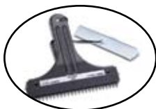
Separation Tool 4053-PM

Recommended for removing either bases or covers from 25-pair super-mini and covers only from 25-pair super-mate modules.