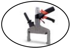
Hand Crimper 4036-25

Designed to hold a 4041-P splicing head in aerial splicing applications. Anchored to the suspension strand, the strand clamps behind and below the splice bundle and can be used with strands from 5 mm (3/16") diameter to 10 mm (3/8").