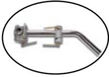
Universal Splicing Head Support Assembly 4045-SHSA

This assembly is designed to hold an MS 2 splicing head so it can be used in all applications.