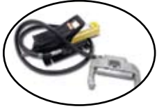
Air/Hydraulic Crimping Unit 4030

Durable, easy to transport tool box with tray. 66 x 29.2 x 28.2 cm (26 x 11.5 x 11.1") Cube: 9.8 kg. (21.7 lbs.) Ctn. size: 67.1 x 30 x 58.4 cm (26.4 x 11.8 x 23")