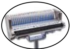
Splicing Head and "T" Bar 4041-P

This assembly contains a splicing head, a pedestal, a traverse clamp assembly with a long bar, and a head clamp for use with two-man fold-back splicing.