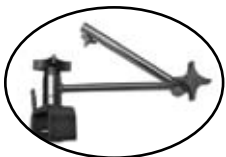
Splice Head Holder 4041-SH

Additional splicing head and "T" bar support for use with the MS 2 system.