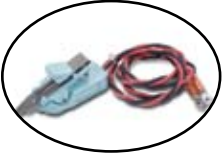
Pair Test Plug 4047

Collapsible for easy transport and setup.