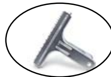
Cover Removal Tool 4053

Used to terminate individual conductors on MS 2 modules.