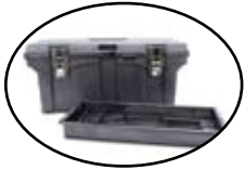
Tool Box with Modified Tray 4028-A

Used to mount the 4040 splicing head assembly in tight situations.