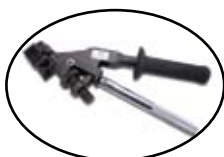
Hand Presser 4270-A

The only recommended tool to separate 4005-DPM/TR modules from any other module. Note: The 4053 cover removal tool cannot be used to separate DPM modules.