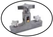
Support Vise 4025

Used to mount the 4040 splicing head assembly in tight situations.