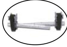
Split Support Tube 4046-CS

This assembly is designed to hold an MS 2 splicing head so it can be used in all applications.