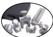
Tool Mounting Kit 3M710-TMK10-A

Used to plug up to seven super-mate modules together.