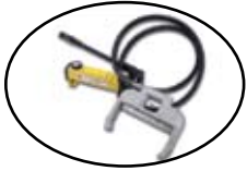
Hand/Hydraulic Crimping Unit 4031

Designed for high-volume module termination and uses air or nitrogen supply. An air cylinder or compressor with output pressure of 6.33–7.03 kg/cm (90–100 PSI) must be used. The unit is either hand- or foot-operated.