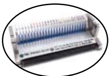
Splice Head 4041-SPL

The 4041-SH is the tool mounting assembly from the 4049-NXG and 4049-R Lite Rigs that holds the 4049-VTB Variable Traverse Brace. It enables the user to position the MS 2 splice head where needed for greater splicing flexibility.