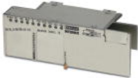
The illustration shows version IBS RL 24 BK RB-LK-LK

Bus coupler with remote bus branch for INTERBUS; twisted pair with 500 kbaud, rugged metal housing with IP67 protection, tool-free mounting on a separate mounting plate, can be used directly on welding robots