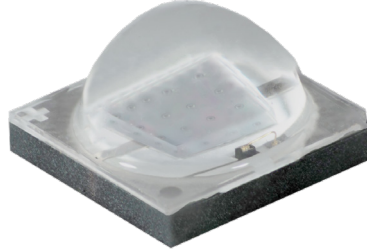
XT-E Royal Blue