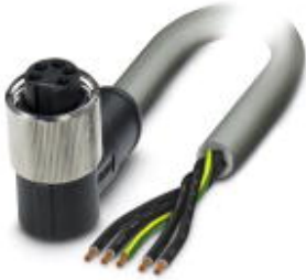
Power cable, 5-pos., gray PUR/PVC, 2.5 mm 2 , free cable end to angled 7/8" 16UNF socket, length: 3.0 m

Please be informed that the data shown in this PDF Document is generated from our Online Catalog. Please find the complete data in the user's documentation. Our General Terms of Use for Downloads are valid ( http://download.phoenixcontact.com )