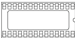
Body Style "A"