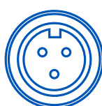
3 pole (13 Amp)