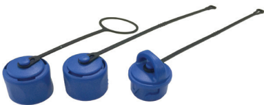
PXP4081 PXP4082 PXP4083