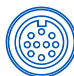
10 pole (3 Amp)