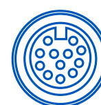
12 pole (3 Amp)