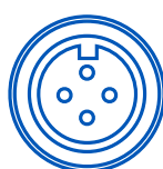
4 pole (8 Amp)