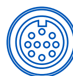
10 pole (3 Amp)