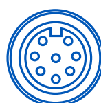
8 pole (8 Amp)