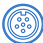
6 pole (8 Amp)