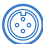
4 pole (8 Amp)