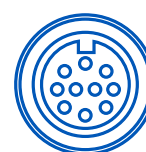
10 pole (3 Amp)