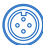
4 pole (8 Amp)