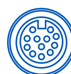
12 pole (3 Amp)