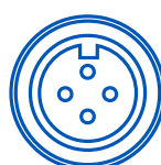
4 pole (8 Amp)