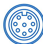
8 pole (8 Amp)