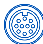
10 pole (3 Amp)