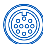
10 pole (3 Amp)