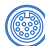
12 pole (3 Amp)