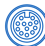
12 pole (3 Amp)