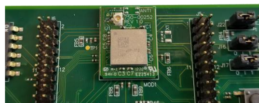
Figure 1: 455-00030 Sterling-EWB Development Kit w/ Chip Antenna