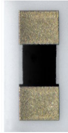
Product may not be to scale

The MIC resistor chips on alumina are designed with low shunt capacitance. Most lower value resistor geometrics are compatible with strip lines, making them ideally suited for microwave circuits.