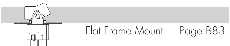
Flat Frame Mount