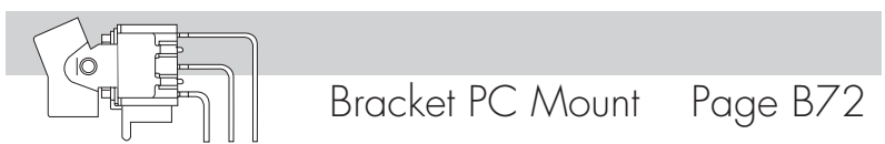
Bracket PC Mount