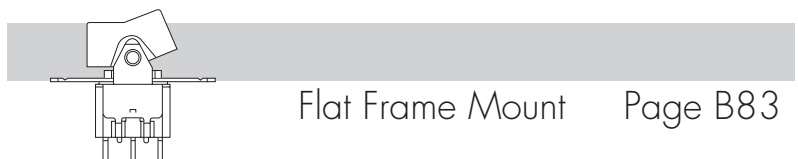
Flat Frame Mount