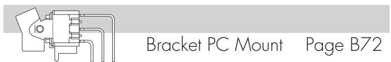
Bracket PC Mount