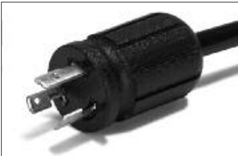
20A NEMA L5-20P Locking Plug

* Use "TL" suffix with Catalog Number for locking plug.