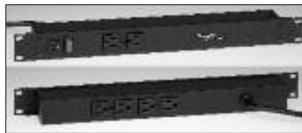
J24B0B (Front & Back)