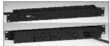
J06B0B20X (Front & Back)