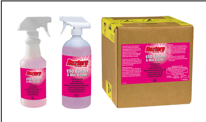
Figure 1. Reztore® Alcohol-Free ESD Surface & Mat Cleaner: 16 Ounces (450 ml) Spray Bottle 1 Quart (950 ml) Spray Bottle 2.5 Gallons (10 liters) Bag-in-Box