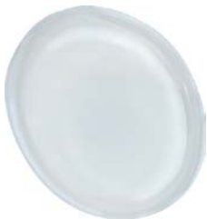
MSM Cover Protection cover for MSM 19 and MSM 22