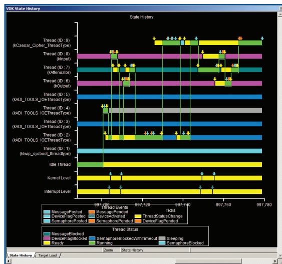
Kernel event history.

For prototype runs and/or small volume deployment, an Analog Devices emulator can be used to flash a program onto your custom system. Accessible through the Automation API, the flash programmer can be scripted, making it possible to develop a turnkey user interface for use by a production floor technician or other individual not familiar with VisualDSP++. Device drivers are provided for all flash devices found on EZ-KIT Lite products, and these drivers can be easily adjusted to support an arbitrary flash device. The Stand-Alone Flash Programmer enables the development engineer to script or automate this process with a license-