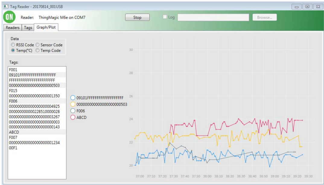
Figure 5. Sensor Information Displayed Under "Graph/Plot" Tab

The second way to view data is by setting up a Log File using the "Browse" button at the top of application and checking the "Log" checkbox. This will dump all the information collected during the session to a logfile including EPC, sensor code, timestamp, etc.