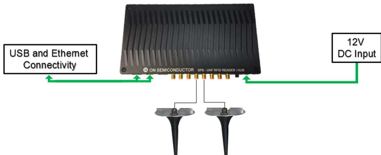
Figure 2. SPSDEVK1MT-GEVK Hardware Setup