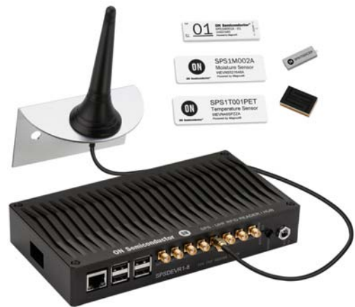
Figure 1. Turnkey Solution Kit Components