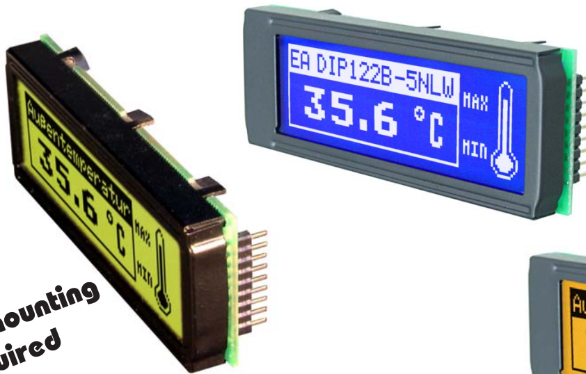
blue-white: EA DIP122B-5NLW Dimension 75 x 27 mm