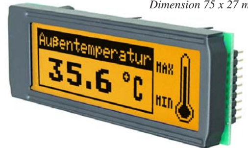
amber: EA DIP122J-5NLA Dimension 75 x 27 mm