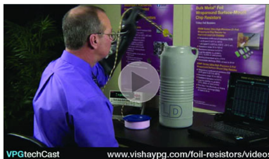
FIGURE 7 - PRECISION RESISTOR IN CRYOGENIC CONDITIONS - ONLY 5 PPM/°C (PRODUCT DEMO)

Different expansion/contraction rates of composite materials in resistors may induce discontinuities during temperature excursions that are not evident at temperature extremes, making an unreliable resistor appear normal. A good resistor must also return to its initial value with no resistance drift. In this demo, a VFR VSMP0805 precision resistor is monitored through the range of +25°C, down to -196°C and back up to +25°C. Results confirm the VSMP0805 exhibits only 5 ppm/°C TCR, experiences no discontinuities, and returns to its exact same starting value, showing absolutely no change in resistance (< 1 ppm measurement accuracy).