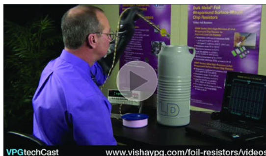
FIGURE 7 - PRECISION RESISTOR IN CRYOGENIC CONDITIONS - ONLY 5 PPM/°C (PRODUCT DEMO)

Different expansion/contraction rates of composite materials in resistors may induce discontinuities during temperature excursions that are not evident at temperature extremes, making an unreliable resistor appear normal. A good resistor must also return to its initial value with no resistance drift. In this demo, a VFR VSMP0805 precision resistor is monitored through the range of +25°C, down to -196°C and back up to +25°C. Results confirm the VSMP0805 exhibits only 5 ppm/°C TCR, experiences no discontinuities, and returns to its exact same starting value, showing absolutely no change in resistance (< 1 ppm measurement accuracy).